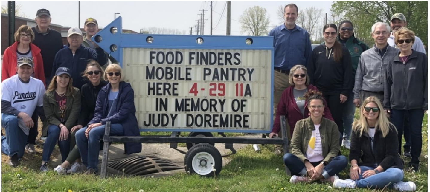
Volunteers supporting the Klondike Mobile Pantry.