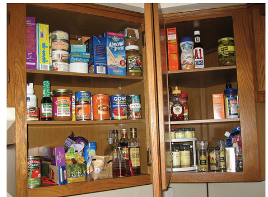
Ketchup goes to the home of a food insecure family

Every project that each of our volunteers works on goes directly to help those who are in need of food. Without volunteers we would not be able to deliver necessary items to the people who need it. Our agency pantries could not have as much food on their shelves, our Mobile Pantry could not offer as wide a variety of food as it does, and our clients' cabinets would have little chance of being filled. Unlabeled (unusable) items in our warehouse means less food and nutrition for our clients and their families.